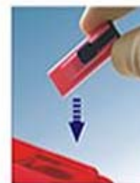
2 Dispose of the lancet in a suitable container