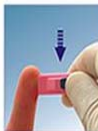
1 Push the safety lancet firmly onto the chosen site, then press trigger