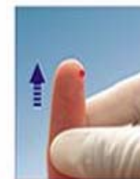
3 Massage the site as directed to get blood flow

Note: Whole blood, serum or plasma collected following regular clinical Laboratory Procedures can be used for this test.